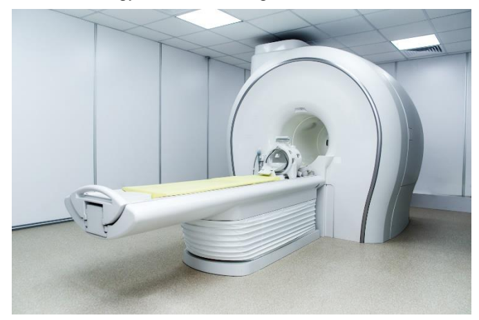
A typical MRI scanner with 8 tons of weight

The technology and field strength of the Neoscan machine is identical to current scanners so that no new