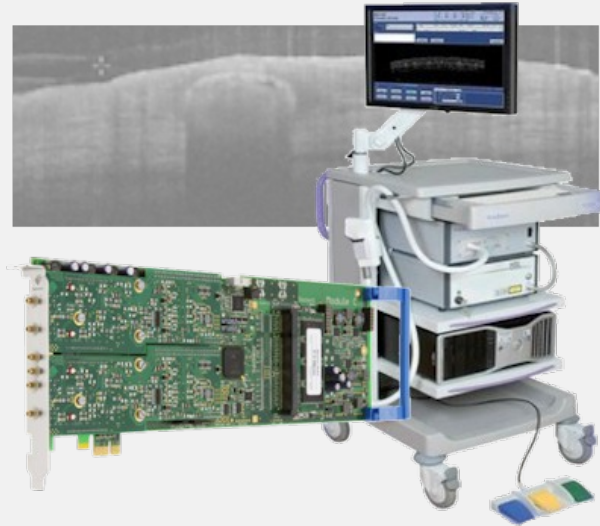
The VivoSight® OCT scanner system

A number of Vivosight systems has been built with this card.