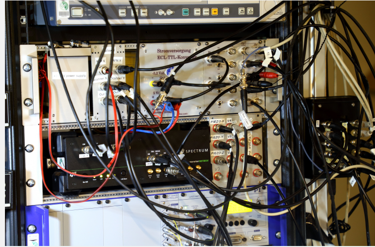
Figure 2 The Spectrum AWG at the heart of the experiment's controls

The AWG controls the LASER, the microwave signal using IQ modulation, generation of radiofrequency pulses and triggering data acquisition devices to determine the spin state. "Effectively it runs the whole experiment thanks to its large number of output channels," explained Thomas Oeckinghaus, the experimental physicist who is doing his PhD on this research. "The key factor in selecting the Spectrum AWG was its speed as our experiments require very short pulses down to between 10 to 20 nanoseconds. At 1.25GHz, it can control these with a very high temporal resolution."