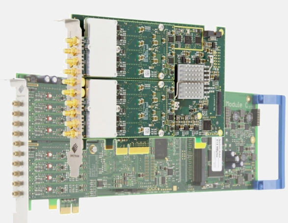
Figure 1. The M2p.59xx series (top) is a half size PCIe card measuring just 168 mm in comparison to the older M2i.49xx products (bottom) which measure 312 mm and occupy a full length PCIe slot.

The challenge for the Spectrum engineers was not just to match the specifications of the older products but to deliver something that set new industry standards for performance; specifically measurement speed, accuracy and precision. Furthermore, the goal was to pack all the new technology into one ½ size PCIe card so that it could be used in more PC systems. That meant a reduction in the products overall size by a factor of two.